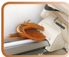
Safety sensors on chassis and foot rest stop the lift instantly at obstacles.