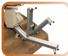
An industry exclusive, automatic fold design eliminates obstructions at the bottom of the stairway. (optional)

(888) 363-2376 | www.stairliftsavings.com